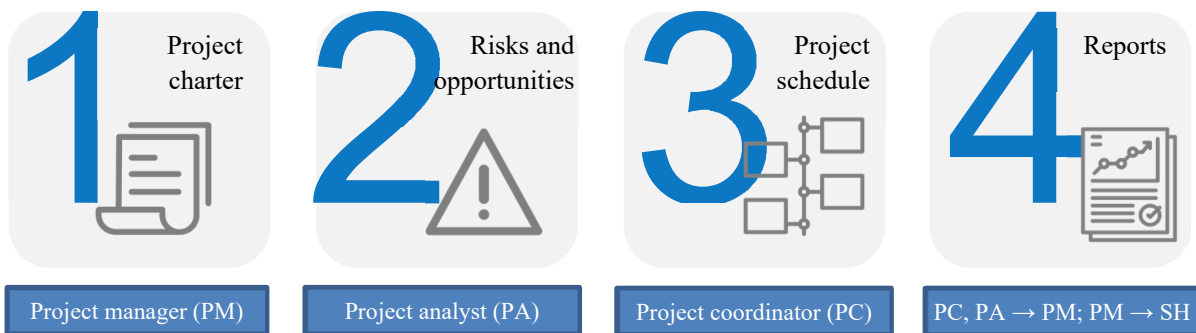
Figure 1 – The cyclical process model of implementation of restoration projects management

The concept of implementing project management in the context of a syncretic approach provided for the implementation process of each portfolio project in accordance with four steps (Fig. 1). Moreover, steps 2-4 were implemented throughout the entire life cycle of the project, and the project manager could also return to step 1 when reviewing the status (once a month).